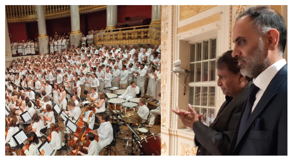
Carmina Burana, the Musical Concert at Konzerthaus, Grober Saal, Vienna, Austria