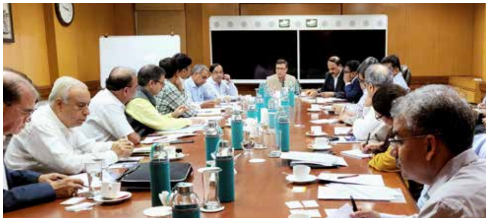
First CAB Technical Committee meeting of Oil & Gas World Expo 2020 on 4 June 2019 at OIL House, Noida.