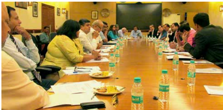
Second brainstorming CAB meeting of GASTech World Expo 2020 on 12 July 2019 at GAIL Bhawan, New Delhi