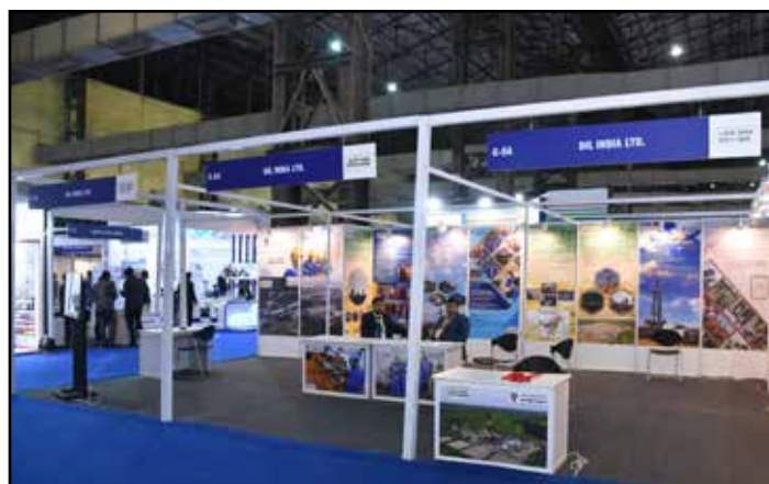
OIL INDIA LIMITED