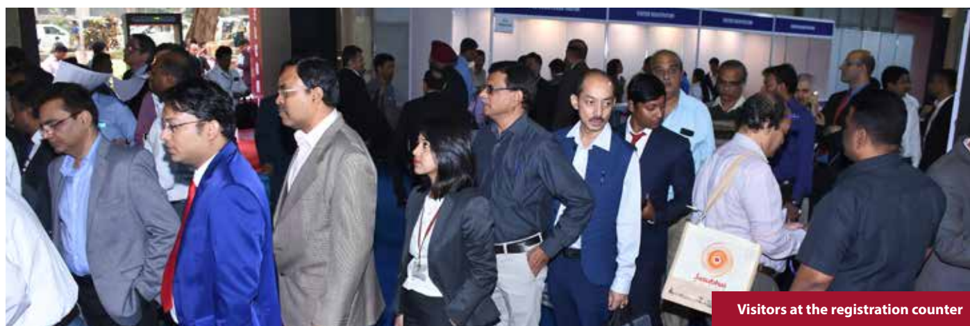
Visitors at the registration counter