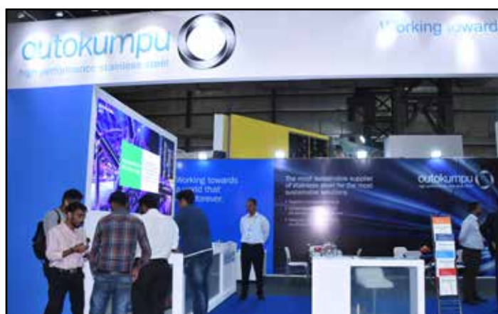
OUTOKUMPU INDIA PRIVATE LIMITED