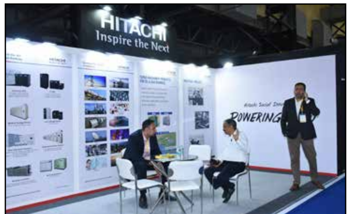
HITACHI INDIA PRIVATE LIMITED