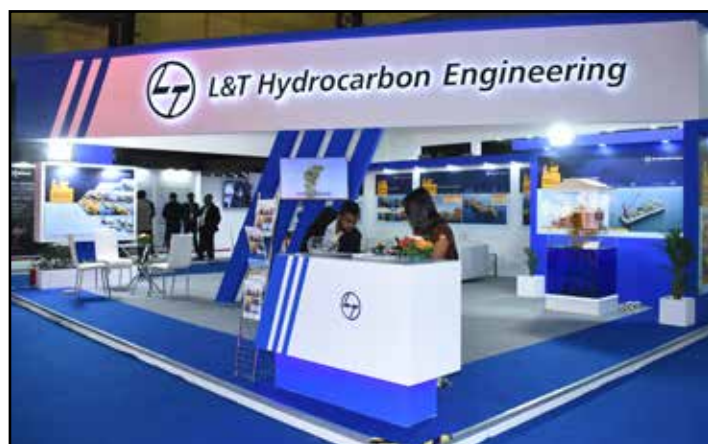
L&T HYDROCARBON ENGINEERING LIMITED