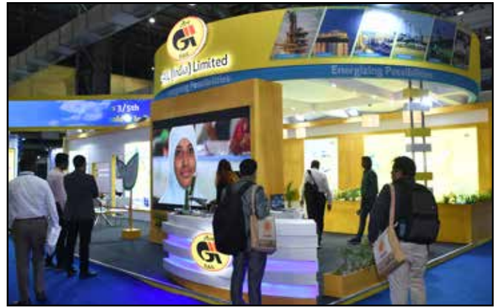
GAIL (INDIA) LTD.