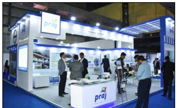
PRAJ INDUSTRIES LTD