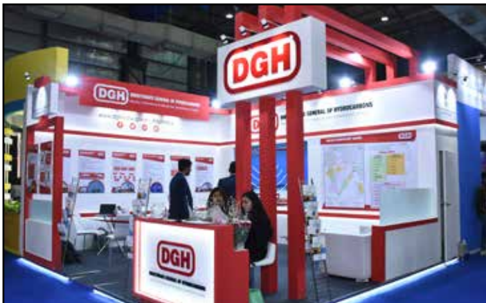
DIRECTORATE GENERAL OF HYDROCARBONS