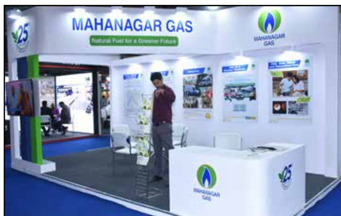
MAHANAGAR GAS LTD