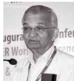
Dr. Anil Kakodkar

"Ensuring access to affordable electricity by 2030 means investing in clean energy sources such as solar, wind and thermal. Today, India is fast emerging as a global clean energy powerhouse, where the renewables sector has taken rapid strides. In such situations, it is the forums like Power World Expo & Conference which play pivotal role in bringing together the key decision makers from the regulatory authorities from the government, power producers, infrastructure & technology providers to a common point to deliberate on the concerns."