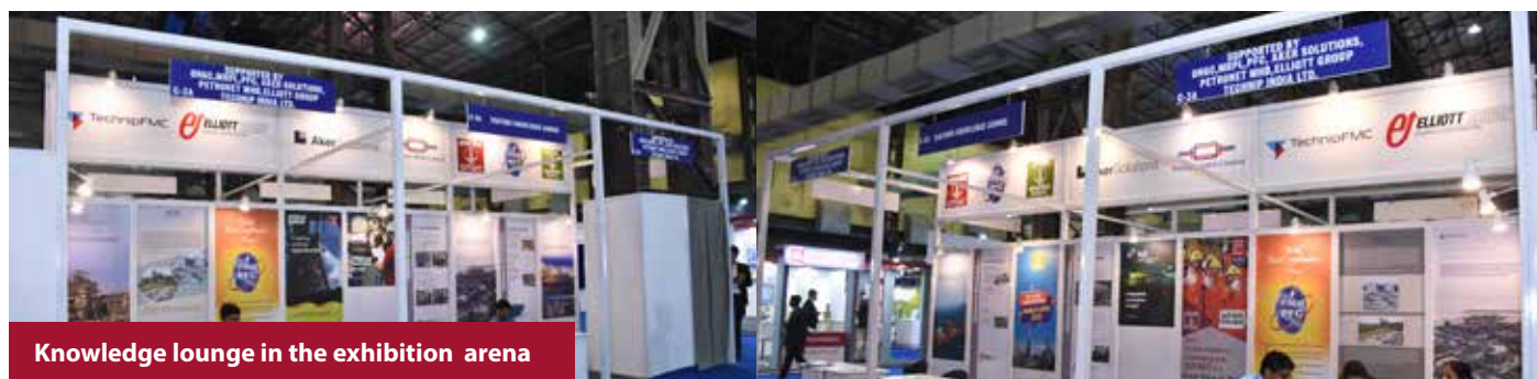
Knowledge lounge in the exhibition arena