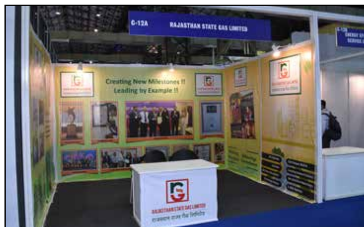
RAJASTHAN STATE GAS LIMITED