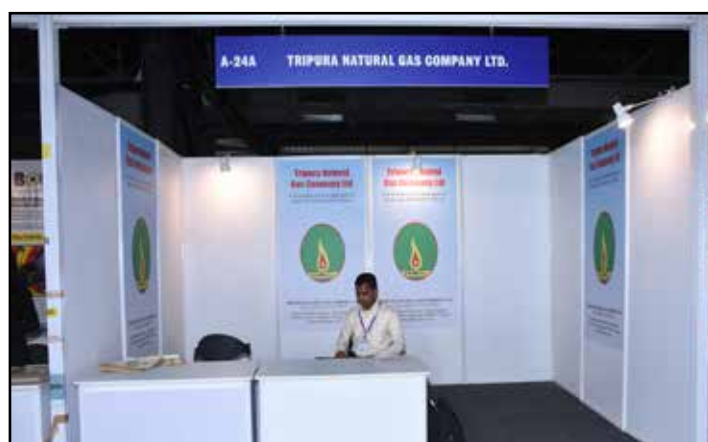
TRIPURA NATURAL GAS COMPANY LTD.