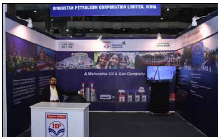
HINDUSTAN PETROLEUM CORPORATION LIMITED