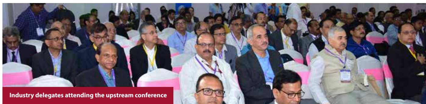
Industry delegates attending the upstream conference