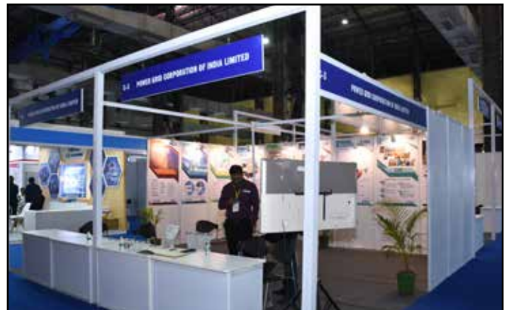
POWER GRID CORPORATION OF INDIA LIMITED