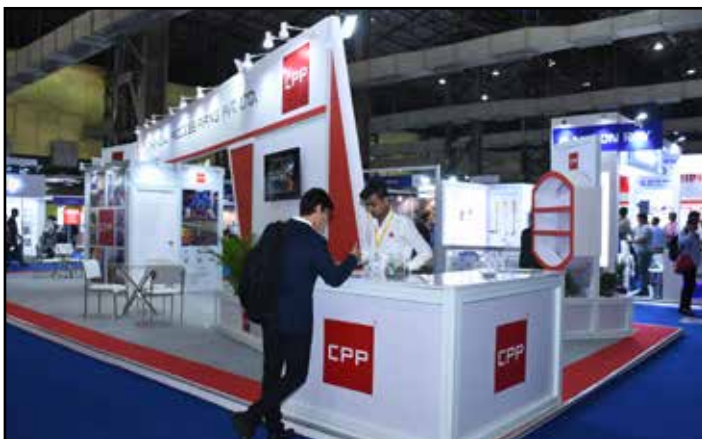
CHEMICAL PROCESS PIPING PRIVATE LIMITED